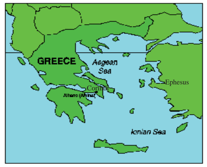
How simple and yet how true. Why is it that mankind must question, criticize, and reject God's biblical directives given for our own well being? The conversion of the Corinthian brethren, which involved hearing and believing God's word, repenting of their past wickedness, confessing Christ as the Son of God and Lord, and being baptized into Christ for the remission of their sins, is the simple and repeated method we see in the Scriptures. Modern critics, the denominational world, and even some of our own brethren will mock the "five fingered plan of salvation" as being that which has its origin in man. Take away the fingers if you like, but what steps do we need more or less in order to gain entrance into the kingdom of God? I've also heard talk of doing away with the invitation at the end of every worship service and whether or not we should even mention baptism when we teach one the gospel of Christ! Change for the sake of God's word is always a good thing, but change for the sake of change should always be questioned as to motive, consequence, and scriptural authority.

Inevitably, sin entered the body of saved believers in