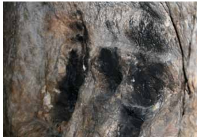
In Hezekiah’s tunnel, this sign shows where the Siloam inscription was surreptitiously taken from the tunnel