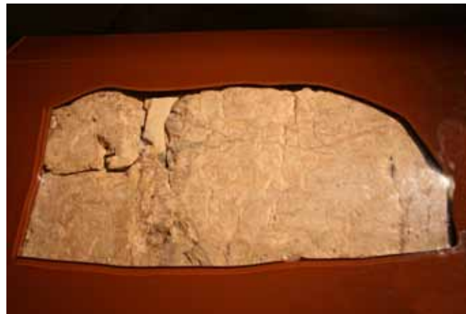
The Siloam inscription on display at the Istanbul museum