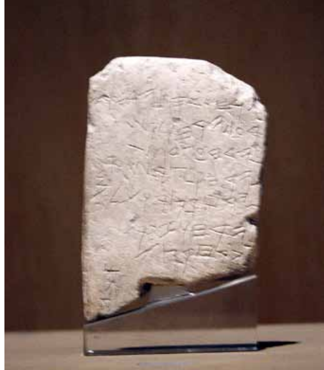
The actual Gezer calendar on display at the Istanbul museum

There was much more to see in the Museum than we had time to absorb. However, these two artifacts were worth the trip.