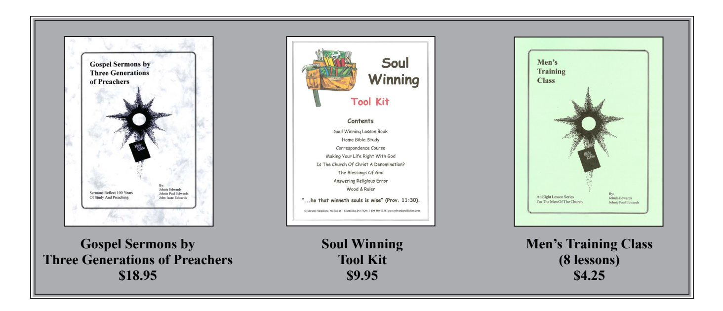
Back To Basics - January 2008