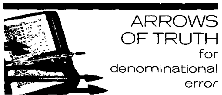
Ward Hogland, Post Office Box 166, Greenville, Texas 75402